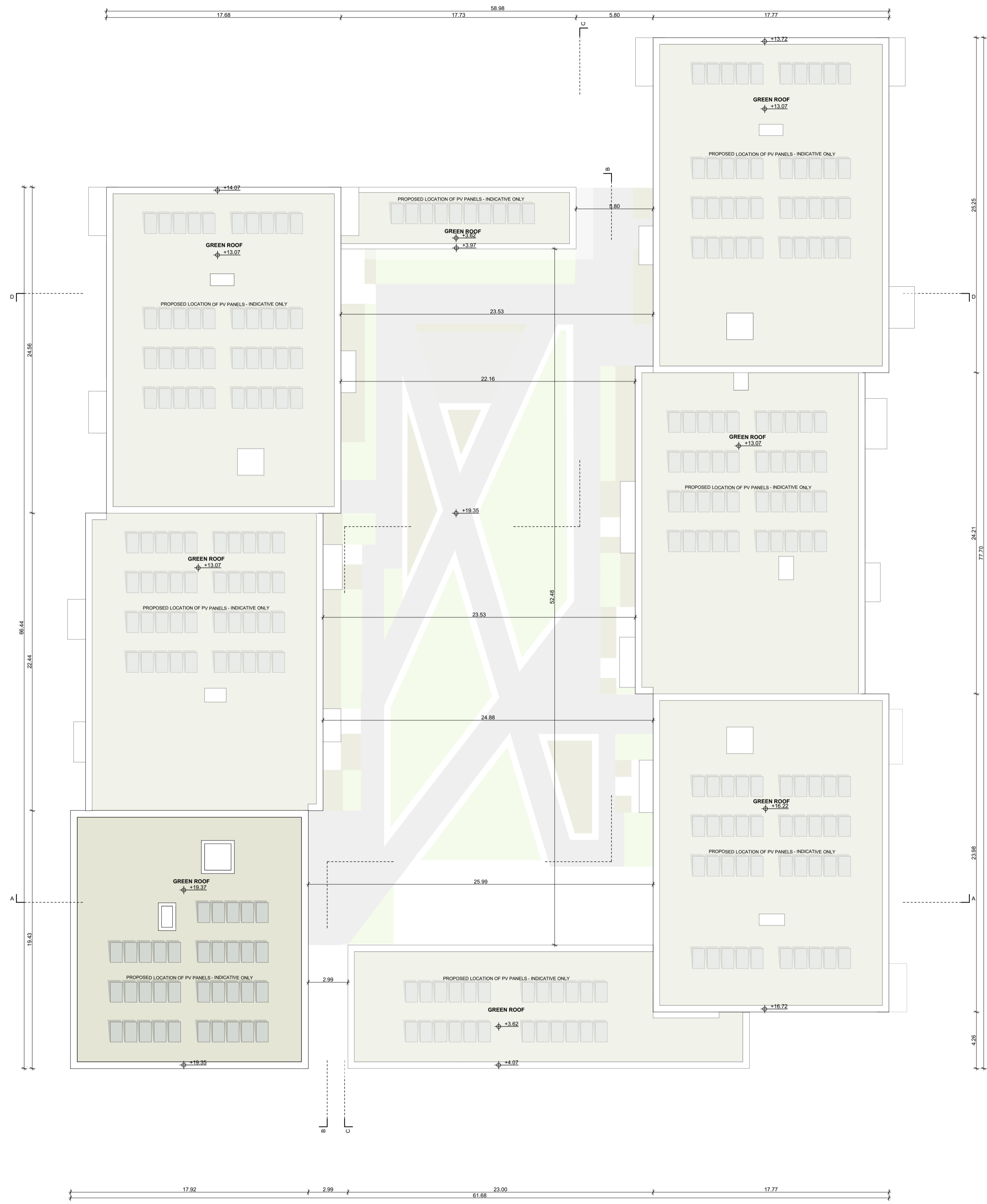
Roof Floor Plan 1:200